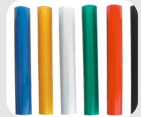
Plate Grade (7 years)