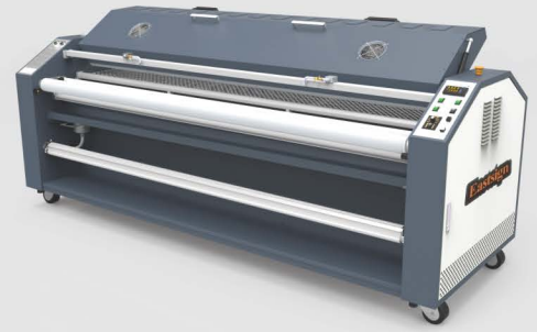
BU-1600WL Working Width:1580mm or 62"