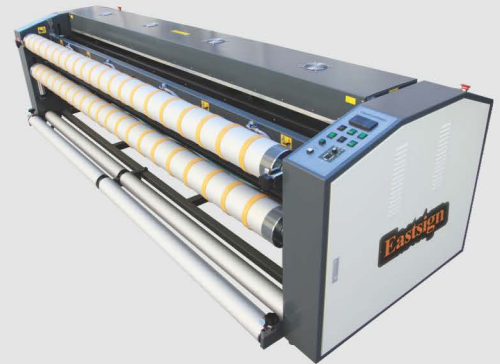
BU-2200WL Working Width:2140mm or 84"